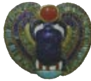
Lapis & Turquoise

Lapidary (the art of gemstone cutting and polishing) has been practised since the very early days of civilisation (Incas, Aztecs, Egyptians etc).