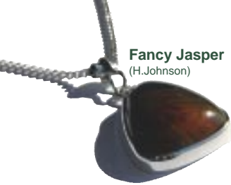
Fancy Jasper