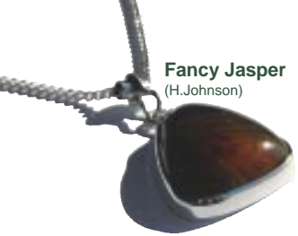
Fancy Jasper