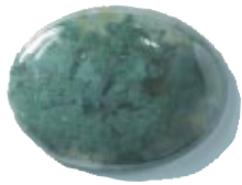
Green Moss Agate

Ever wondered how gems are cut and polished ?